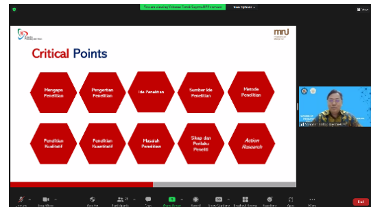
Figure 3. First Speaker's Presentation

The next session presented by the second speaker reviewed material on techniques for writing national reputable scientific journals indexed by SINTA and international reputable scientific journals indexed by SCOPUS. It is important to be able to show how research findings contribute to scientific knowledge.