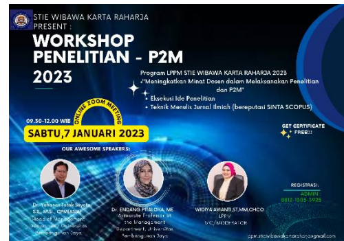
Figure 1. Workshop Activity Flyer

This workshop activity was attended by 30 special lecturers of Management and Accounting study programs with the concept of a virtual workshop, using the Zoom meeting facility.